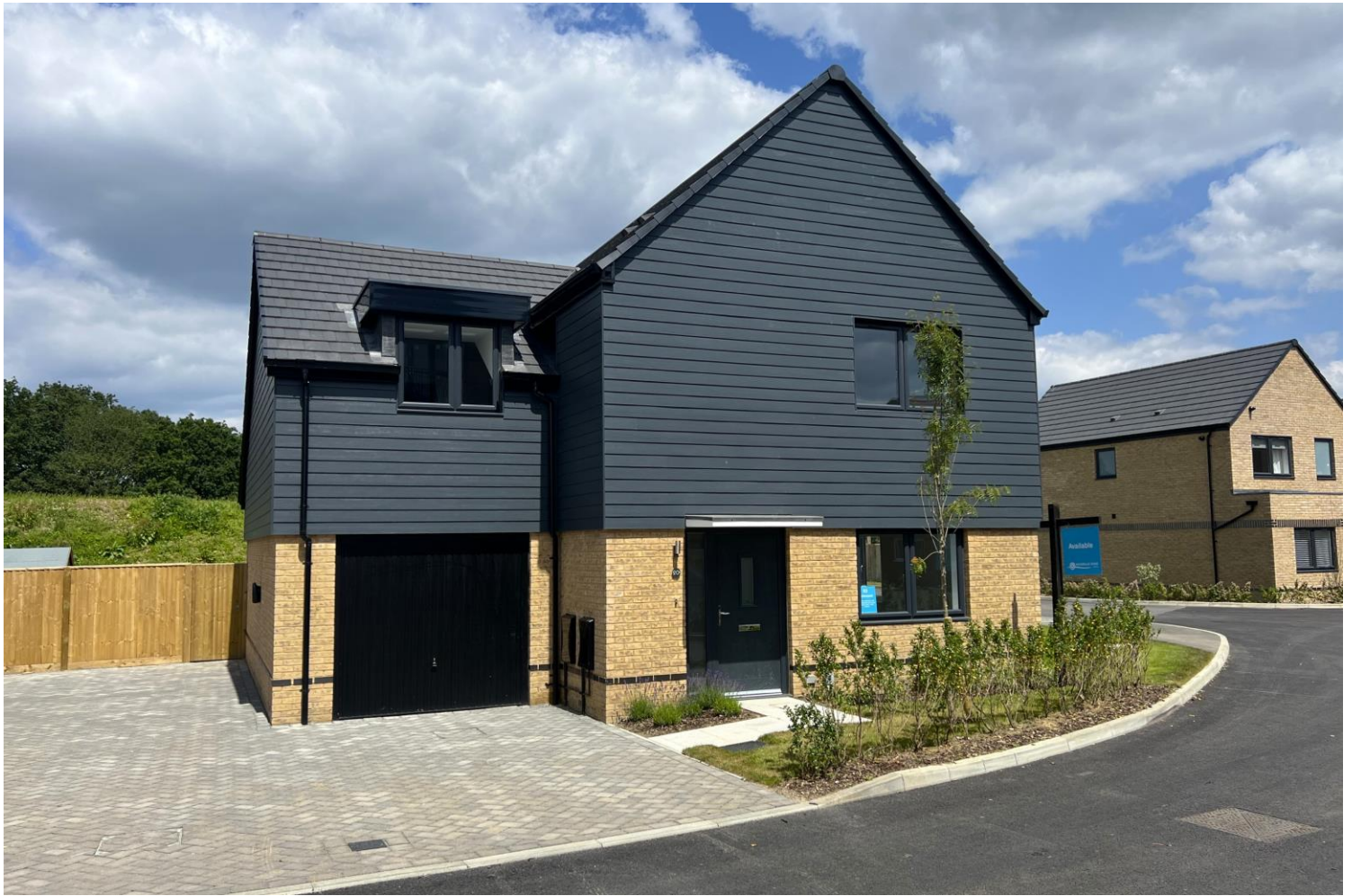
20 Exbury Crescent Plot 93 – Amber Waterside, Cranleigh £15,000 Stamp duty incentive on this home £745,000 - Freehold